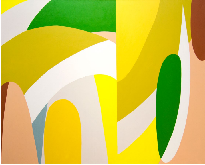
Harmony, 2022 Acrylic on canvas 48 x 60 inches