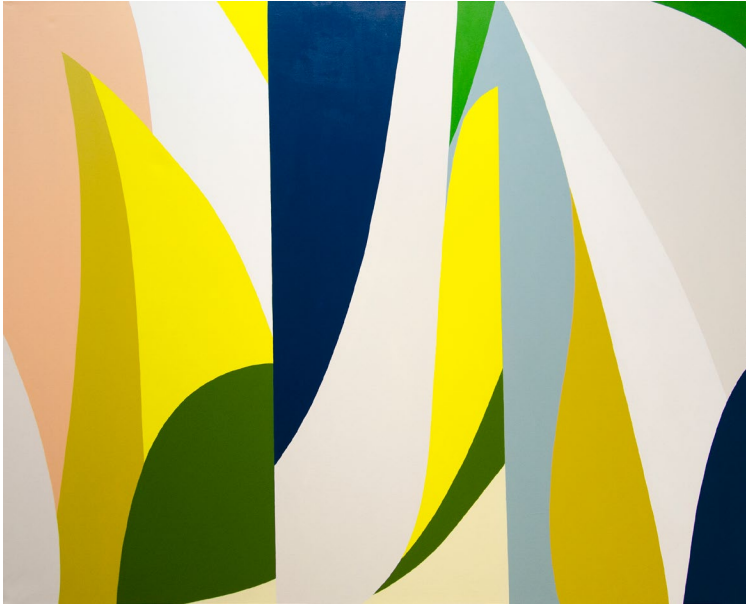
To Listen and Be Heard, 2022 Acrylic on canvas 48 x 60 inches