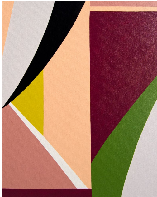
Constantly Evolving, Intertwining, 2022 Acrylic on canvas 20 x 16 inches

“We are nature, so we won’t live without the planet. In that sense, we are in community whether we realize it or not. So, I guess I find a sense of community in all things. I’m beginning to see by answering these questions that my sense of community and togetherness are the shared.”