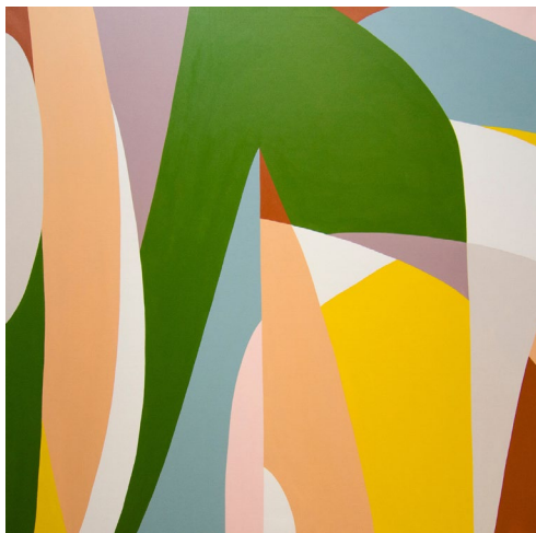
Idealism and Pragmatism are Compelling Companions, 2022 Acrylic on canvas 48 x 48 inches