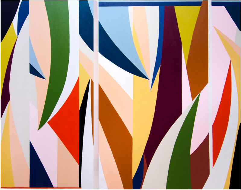
Collective Action (diptych), 2022 Acrylic on canvas 48 x 60 inches