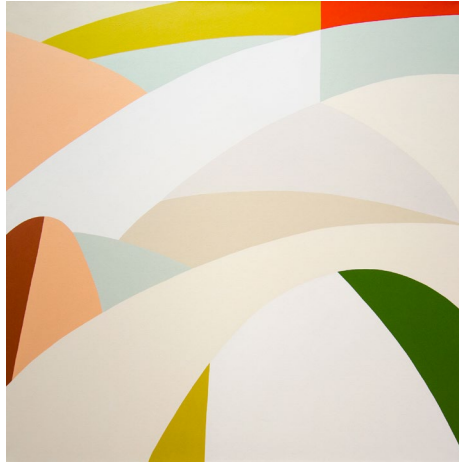
A Sense of Belonging, 2022 Acrylic on canvas 48 x 48 inches