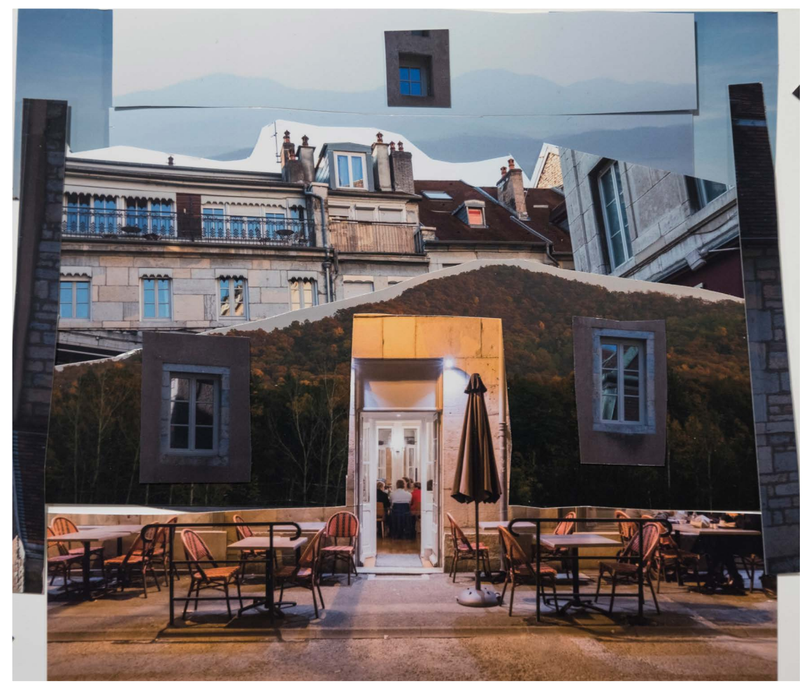
STUDENT COLLAGE EXAMPLE