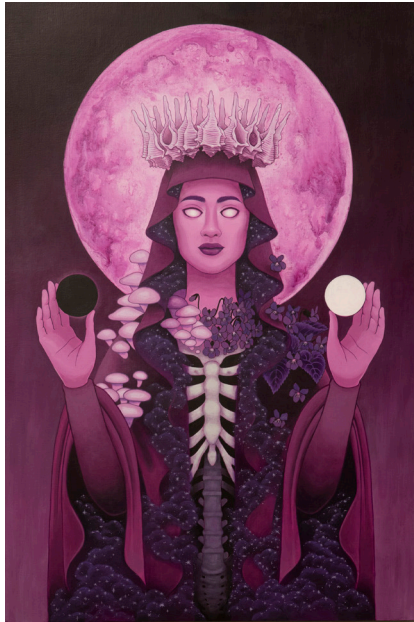
'Violet' by Sam Gray