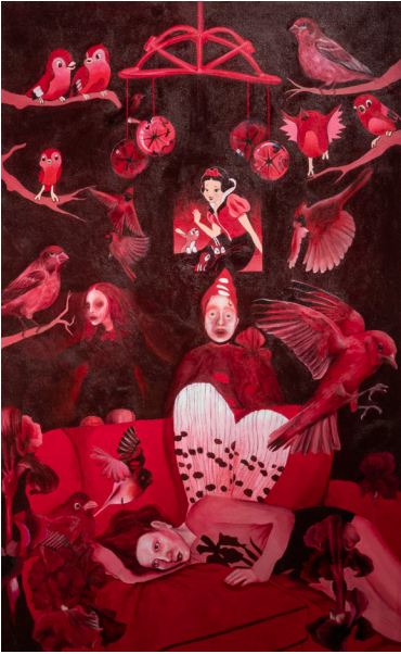
'The Thin Place' by Madeleine Rhondeau-Rhodes

What might the artist be thinking about or imagining in this painting?